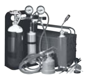
In former times