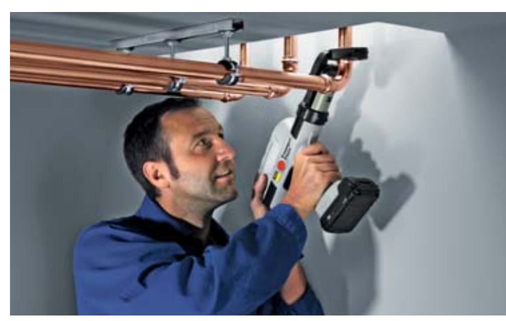
Working without a trace: With the Viega press tools, you can work effortlessly in the most hard-to-reach places without leaving a trace.